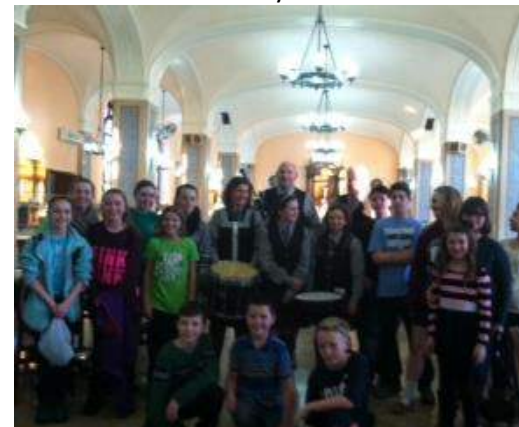
Junior Boys and Girls visiting with the Sisters at St. Joseph's Convent.