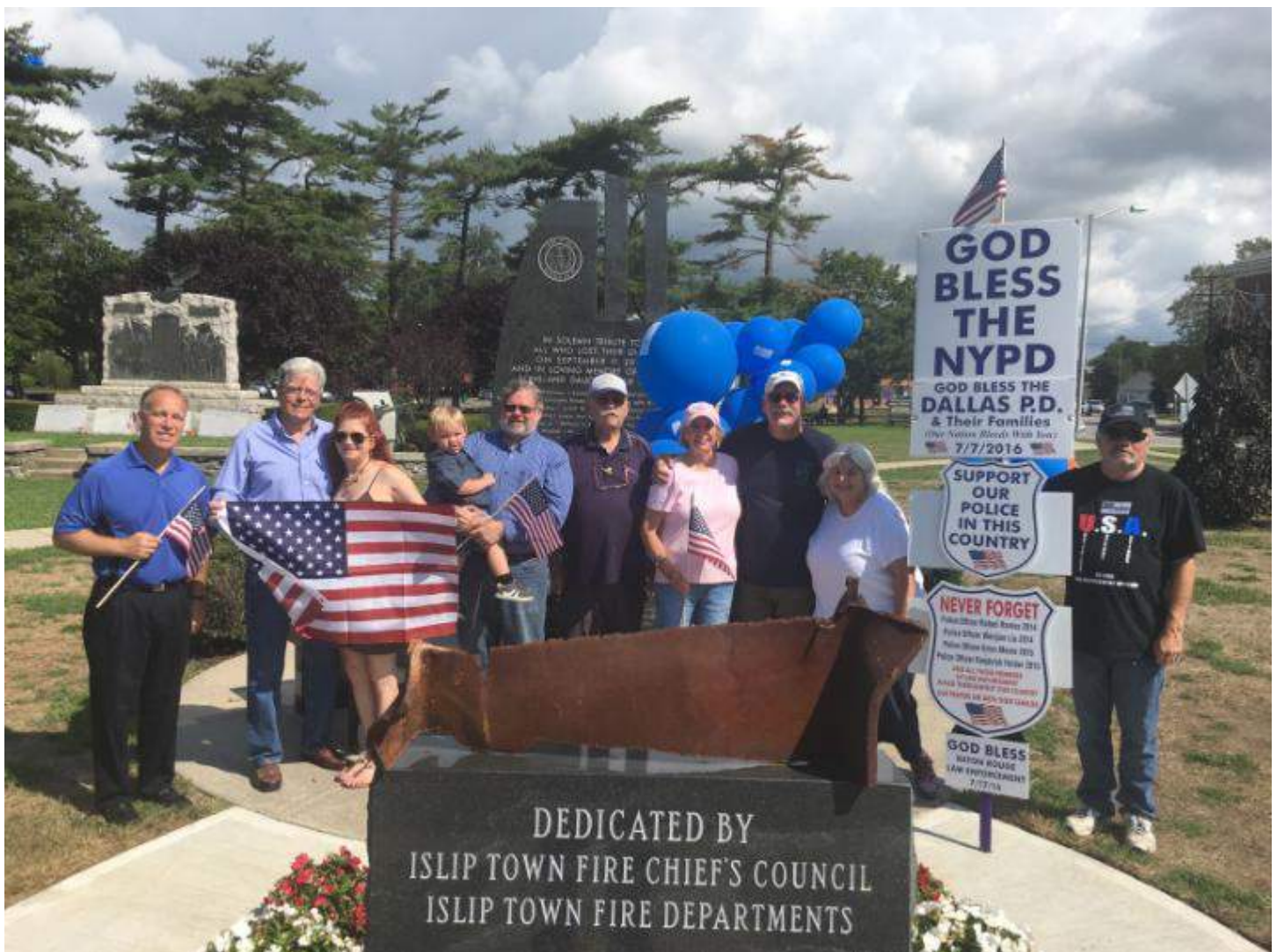
Members of Division 7 supporting the Blue Lives Matter rally in Islip.