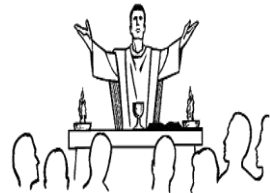
Deceased Members Mass