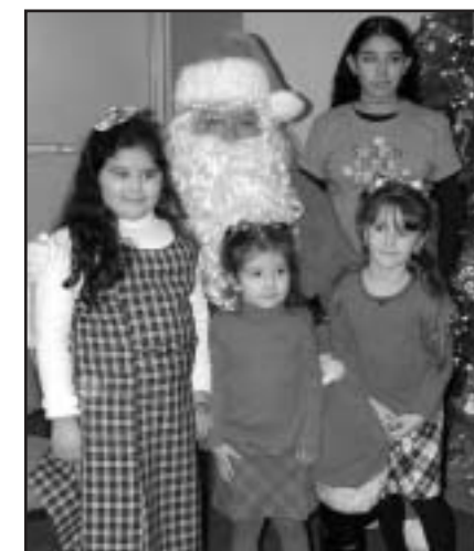
On Saturday, December 18, the Division sponsored a Christmas Party along with gifts to approximately 100 children from the community

JMJ Hair Studio 136 Connetquot Avenue East Islip, NY 11730 859-9100