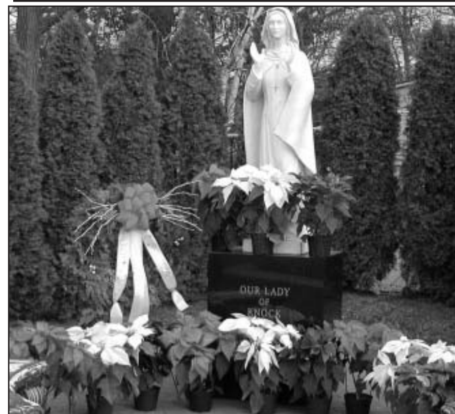
If you haven't taken a moment from your busy schedule, please stop by and visit the Statue of Our Lady of Knock. Division & LAOH placed a tribute to our soldiers in the form of Red, White and Blue Poinsettias.