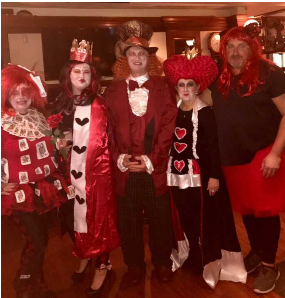
Queen of Hearts Halloween costumes