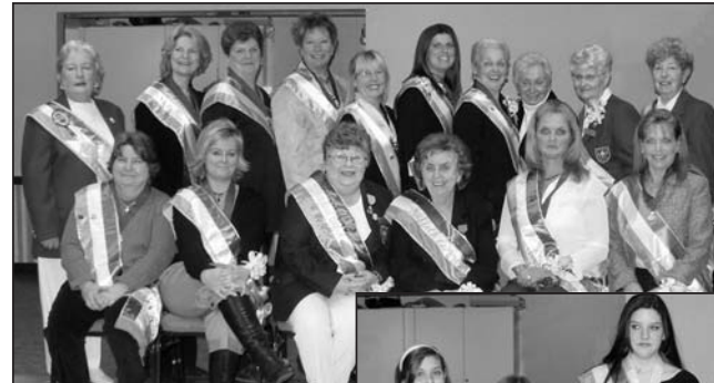
Division 7 L.A.O.H installed the Division Officers on Wed, Jan 10, 2007.