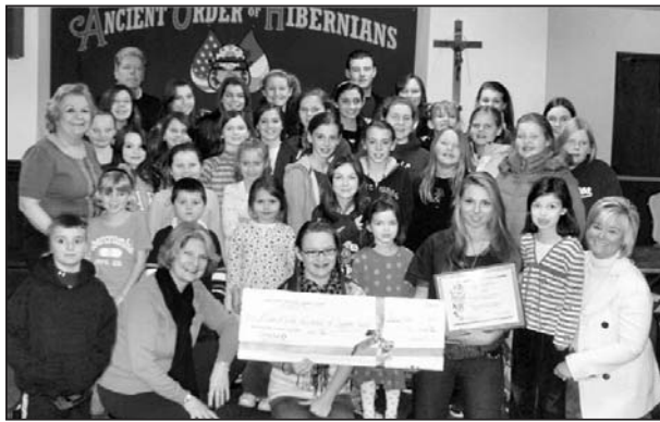
Division 7 Juniors making their annual donation to "The Make-A-Wish" Foundation.