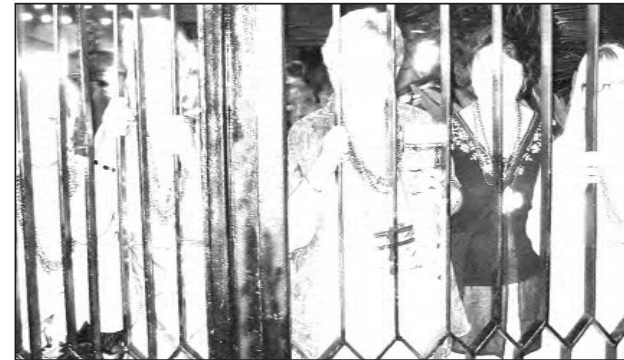
Delegates after a day of business!