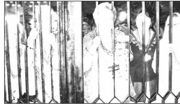
Delegates after a day of business!