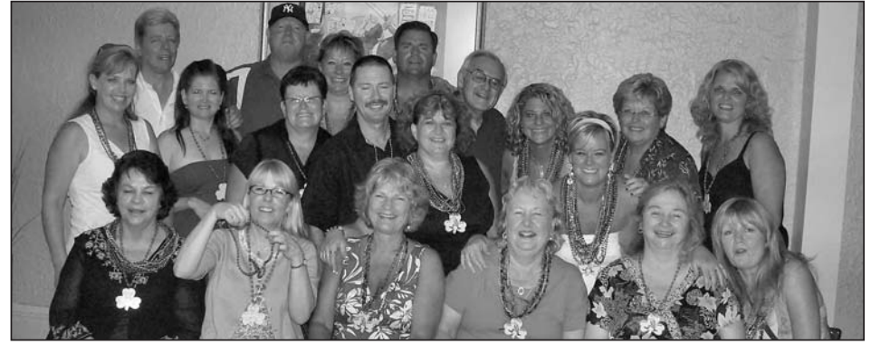
At the 2008 National Hibernian Convention in New Orleans, Division 7 was represented by many delegates. Delegates before the business meeting.