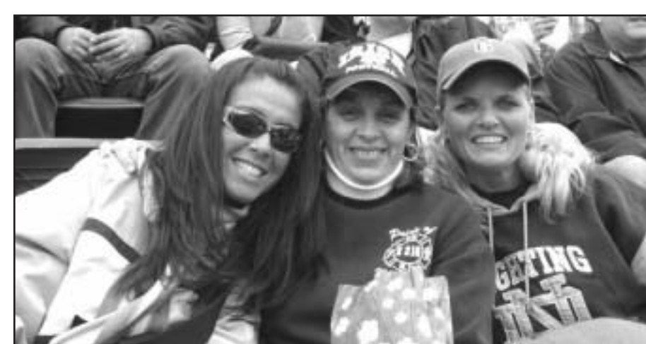
The Notre Dame - Navy football game at Giant Stadium in October brought out many members for an enjoyable day! The next football trip will be to the West Point for the Army Air Force game. Then to Phoenix for the Giant game!